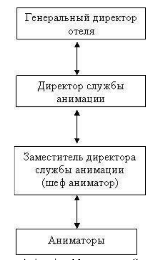
Figure 2. Animation Management Structure