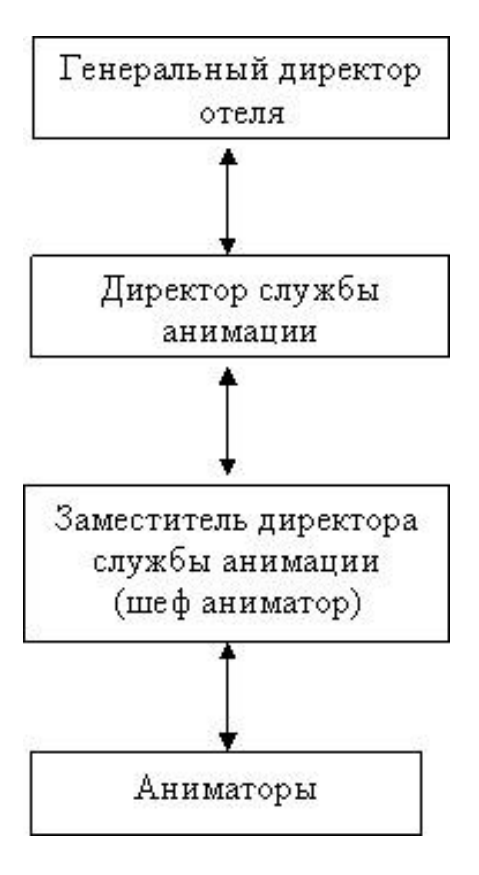
Figure 2 - Animation management structure